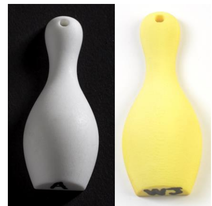
1-2 hrs / 1000 ps