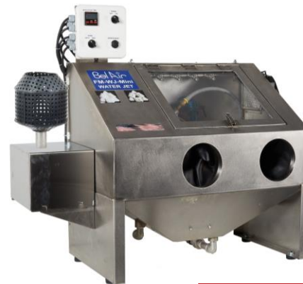
■ FM-WJ Mini-T

Wet Blasting for Build Removal & Surface Prep (Automated Tumbler)