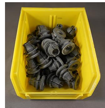
4 min./60 pcs. Tumble Water Jet