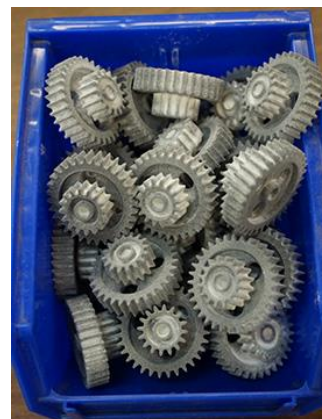
2.5 min./40 pcs. Tumble Water Jet