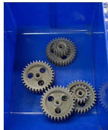
2.5 min. + .5 min. Hand Finish