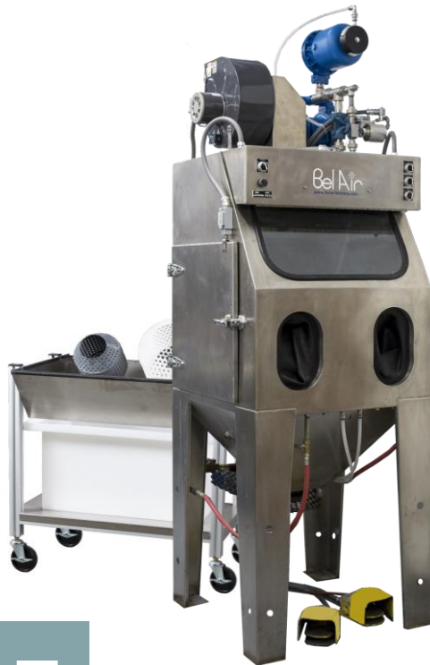
■ FM-WJ 33-2